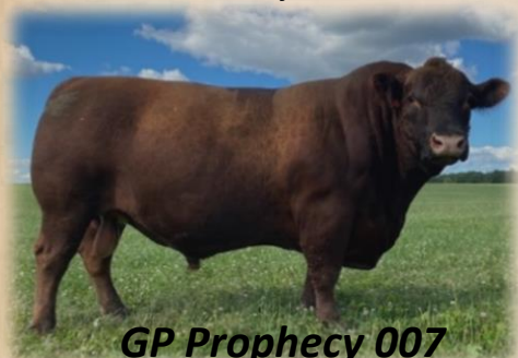
GP Prophecy 007 Ralph Buhr Glenwood City, WI