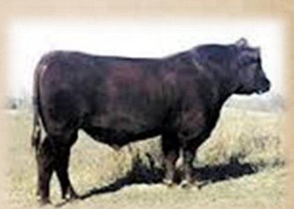
GP Momentum 130 Burbank Cattle Co. St. Catherine, MO

THANK YOU TO THESE BUYERS WHO HAVE SUPPORTED US THROUGH THE YEARS!