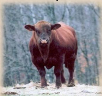
GP Landmark 529 KTH Red Angus Hinkley, MN