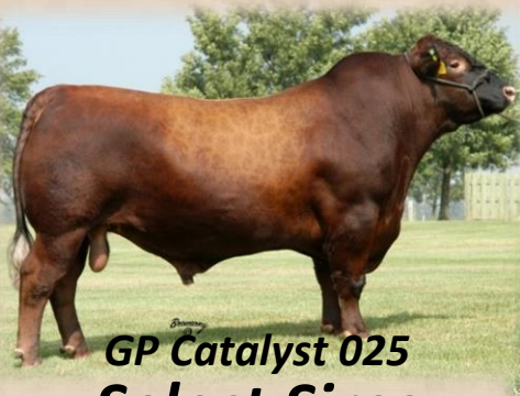
GP Catalyst 025 Select Sires Plain City, OH